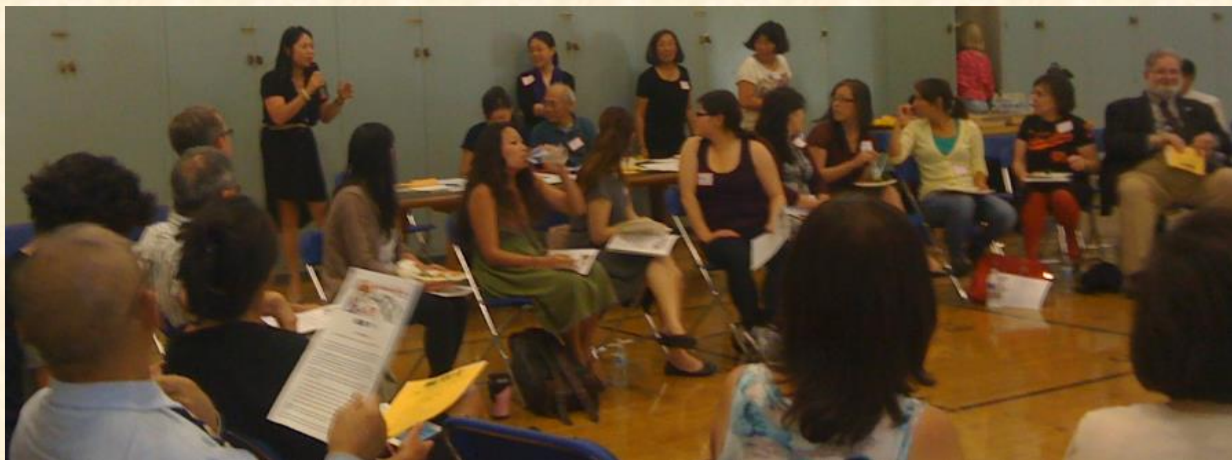
Interactive and engaging question and answer session.