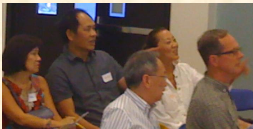
TACT and AAAA members and friends.