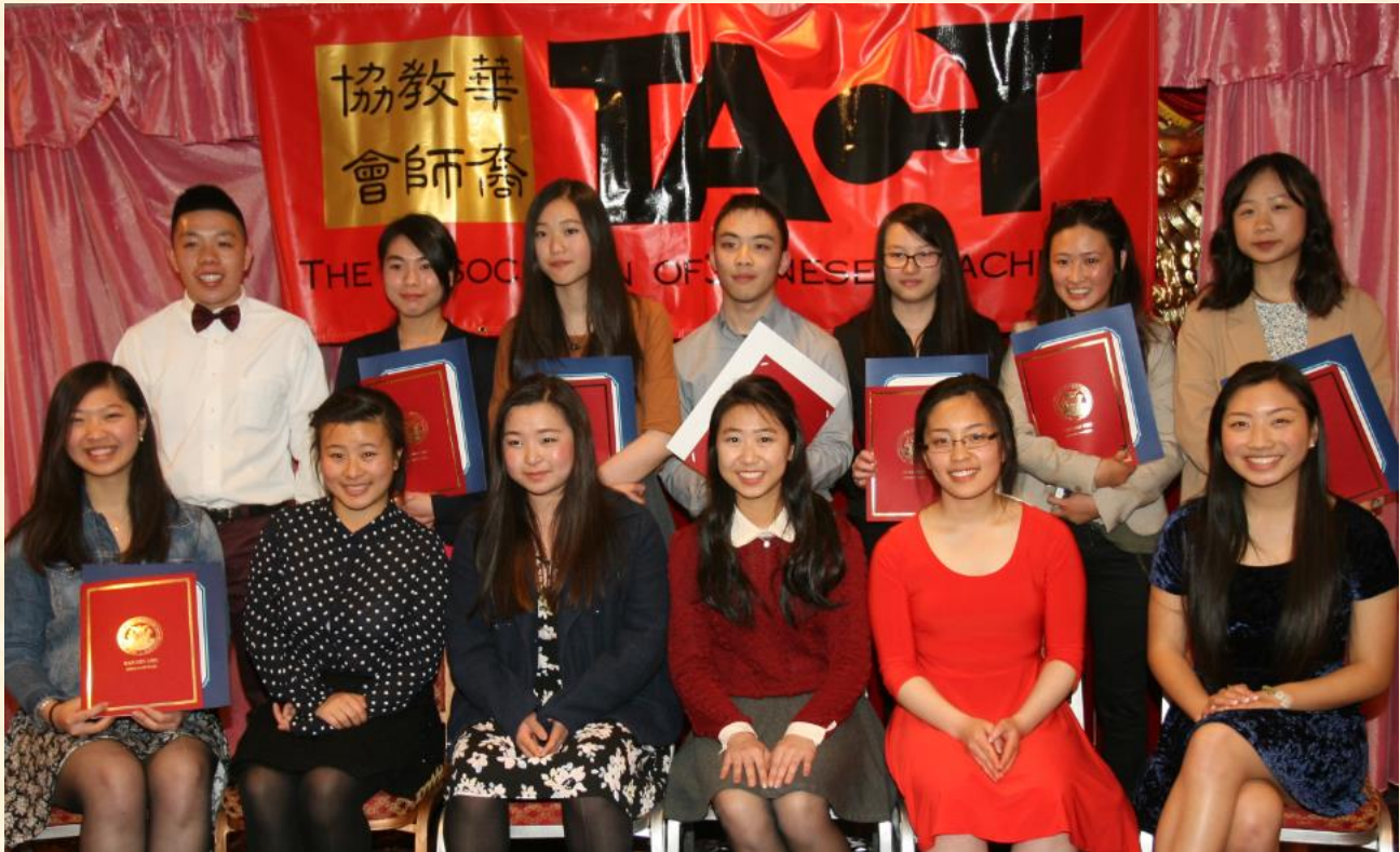
2015 TACT Scholarship Recipients