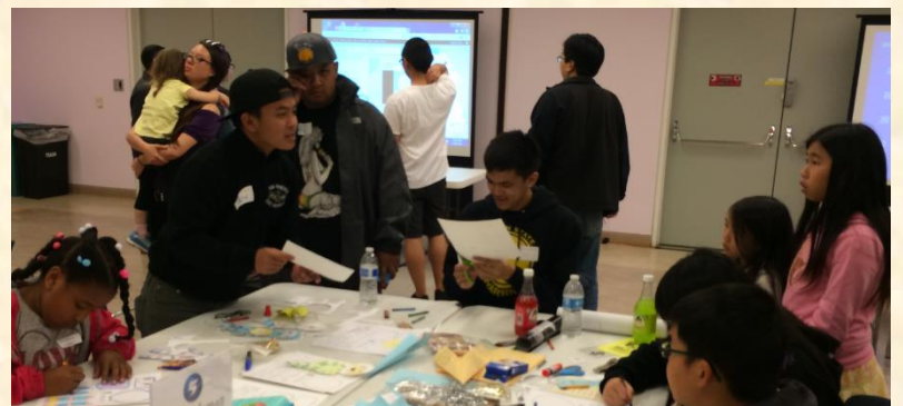
The “Astronaut” Table