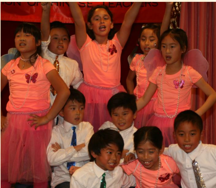
Show-stopping entertainment provided by 2 nd graders from Robert Louis Stevenson Elementary School.