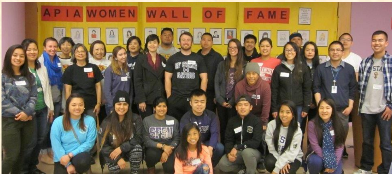
Students, Faculty from San Francisco State, TACT Members