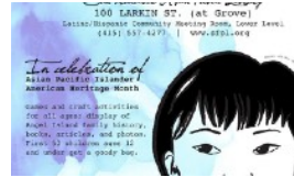
ANGEL ISLAND IMMIGRANT VOICES 5/7 MAIN LIBRARY