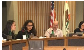
SFUSD ASIAN EXCLUSION REPEAL SCHOOL BOARD