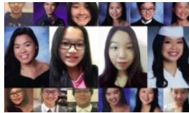
SCHOLARSHIPS AWARDED TO 16 HIGH SCHOOL SENIORS