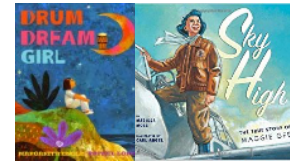
TACT BIOGRAPHIES COMING SOON AND BOOKS FOR MAY