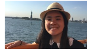
A LETTER FROM LISA YU CLASS OF 2016