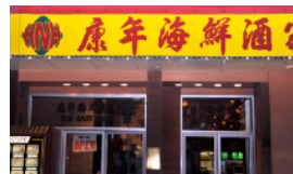
SCHOLARSHIP DINNER 4/28 FAR EAST CAFE