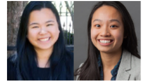
PROFILES WHERE ARE THEY NOW?