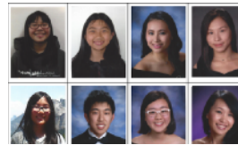
TACT SCHOLARSHIPS AWARDED TO 12 HIGH SCHOOL SENIORS