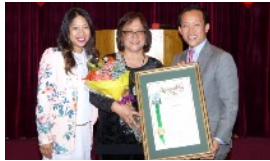
SCHOLARSHIP DINNER FAR EAST CAFE