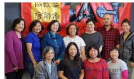
TACT RETREAT UNIVERSITY OF SAN FRANCISCO