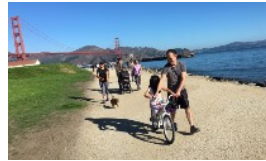
WALKATHON CRISSY FIELD SAN FRANCISCO