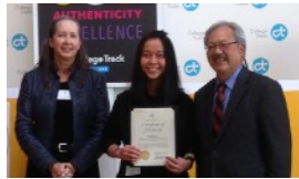
MAYOR'S SCHOLARSHIP COLLEGE TRACK